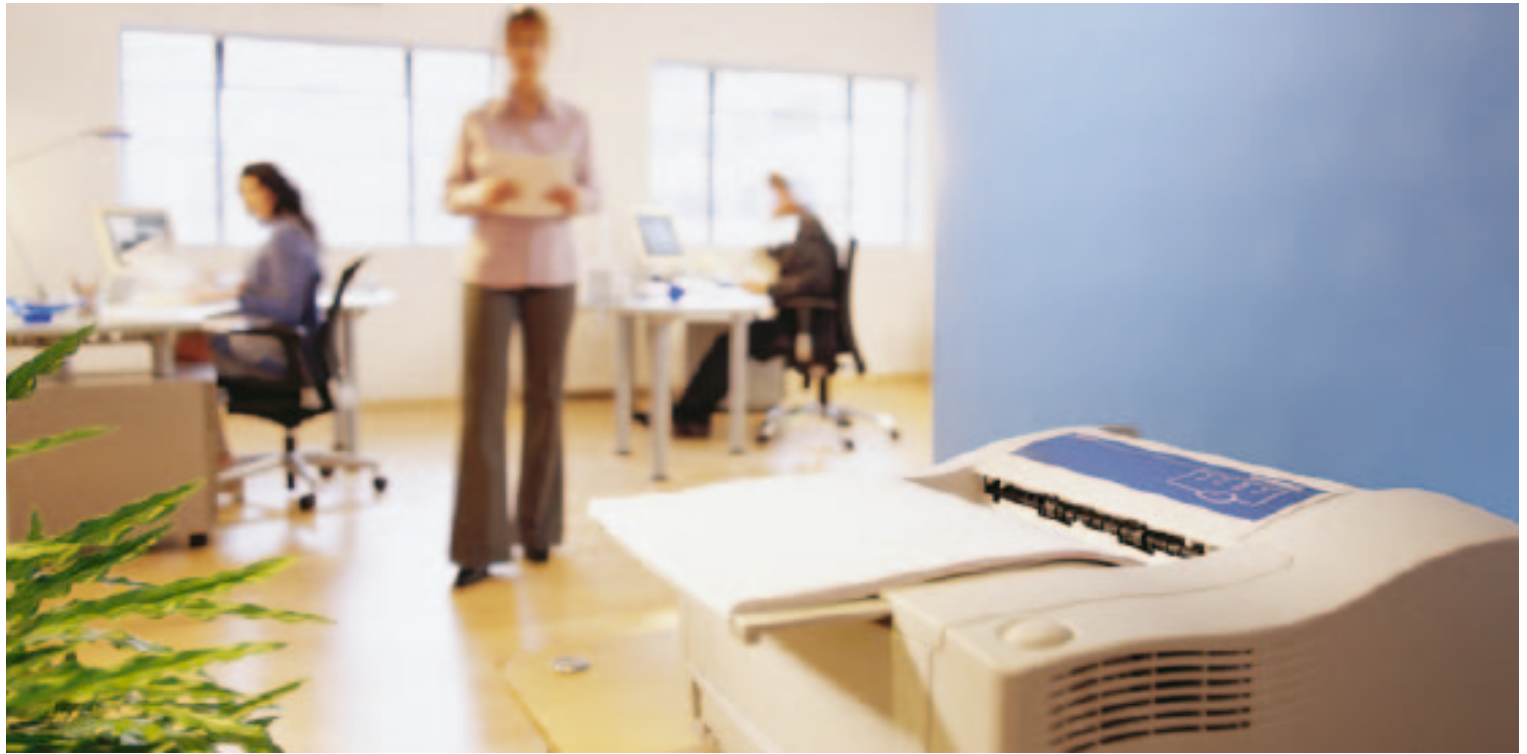
B4250: High-speed personal printing for professionals